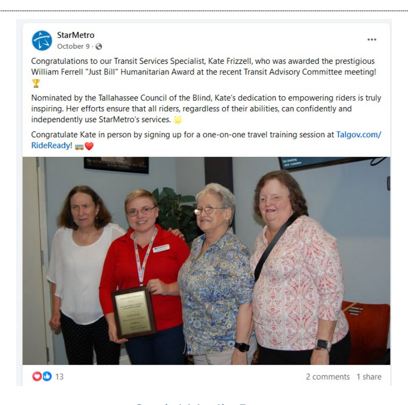
Social Media Post

She communicates, educates, facilitates and updates to ensure equality, independence and dignity for all!"